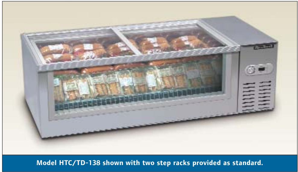
Model HTC/TD-138 shown with two step racks provided as standard.

Five years against failure of compressor. One year against defective material and workmanship, includes labor.